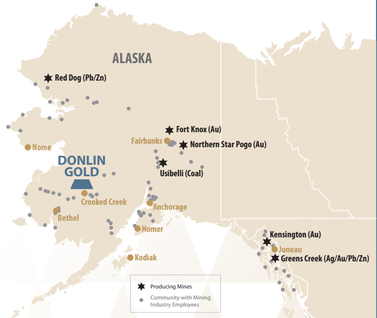
Map Source: Alaska Miners Association, "The Economic Benefits of Alaska's Mining Industry" February 2021.

Successful track record of building and operating mines